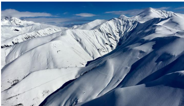
Bucket List Experiences!