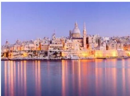
Relive the Middle Ages as you view the historic tapestries and armor in Valletta's Palace of the Grand Masters.