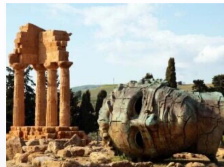
Take in some of the world's best-preserved Greek ruins at the Valley of the Temples.

https://www.windstarcruises.com/cruise/overview/italy/rome-to-rome/sicilian-splendors/?pkgid=347388