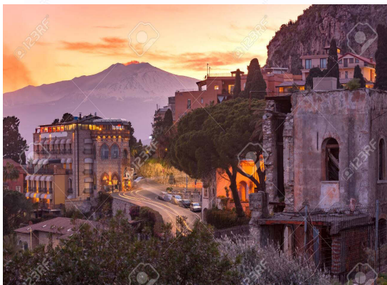
Mt Etna at sunrise

stunning Amalfi Coast pass by from the deck of your intimate small ship and raise a glass of limoncello to another blissful day in the warm Mediterranean sunshine.